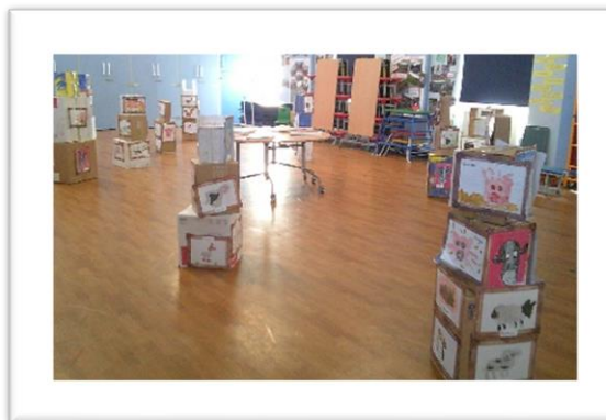
Reception Art gallery 2024 "Farm animals"

Moat Farm Infant School Brookfields Road Oldbury West Midlands B68 9QR